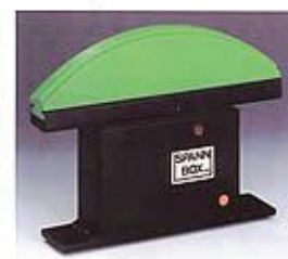
Spann Box Size 2

® Registered trademark of Murtfeldt Plastics Germany