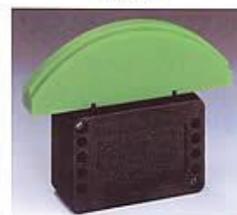
Spann Box Size 30