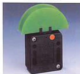
Spann Box Size 0