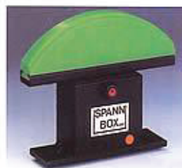
Spann Box Size 1